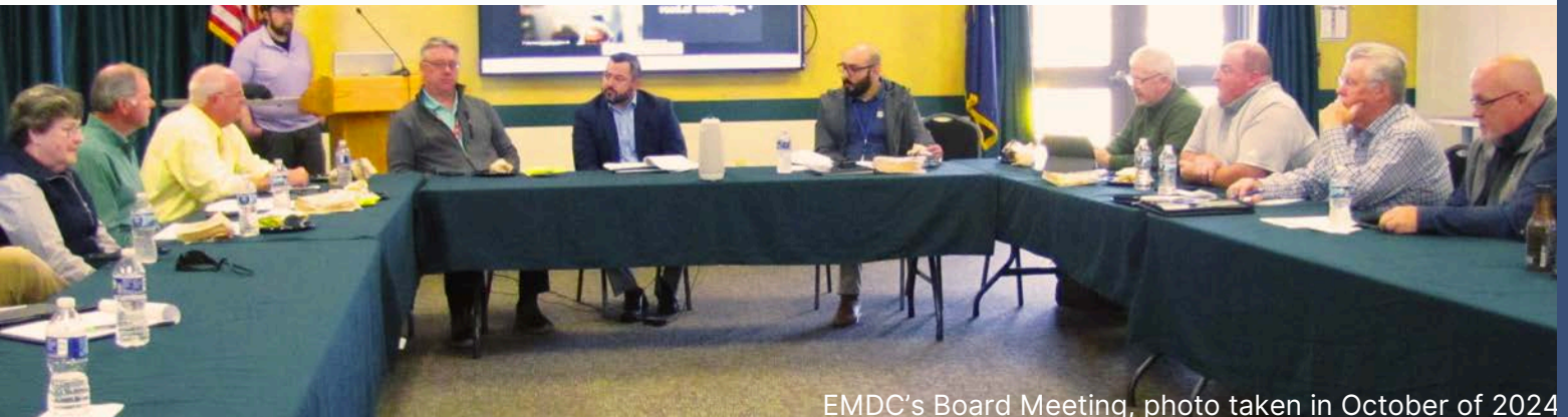
EMDC's Board Meeting, photo taken in October of 2024