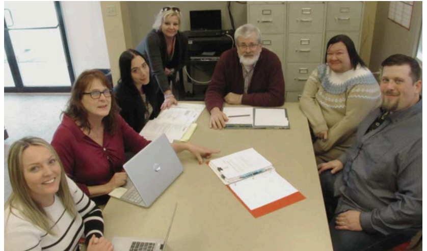
Workforce Team Meeting