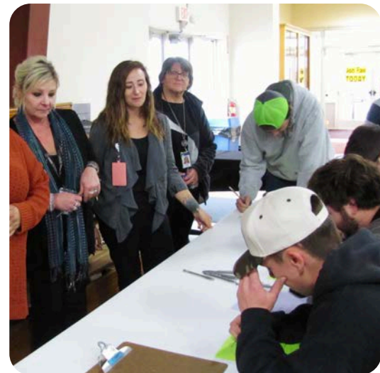
Workforce at the Bangor Career Fair