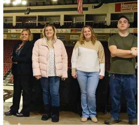
Workforce Building Community Partnerships

Our Youth Workforce Initiative equips young people with the skills and support they need to build a strong foundation for long-term career success, creating a ripple effect of impact.